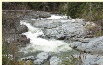
One of the many river views on Hwy. #4