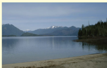
Breathtaking Kennedy Lake