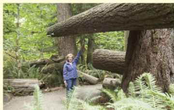
Cathedral Grove a must see!

460 Marine Drive, Ucluelet, BC V0R 3A0 • Vancouver Island FOR INFORMATION & RESERVATIONS CALL Toll Free: 1-888-936-5222 Tel: (250) 726-2686 Fax: (250) 726-2685 Email: info@awesomeview.com